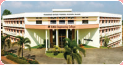
KMEA Engineering College