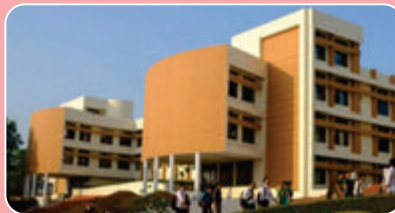
KMEA College of Architecture