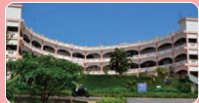
KMEA College of Arts & Science