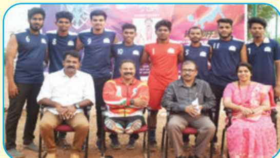
AHAS 2K18 Volleyball Team