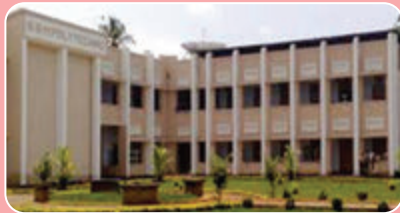
Seethi Sahib Memorial Polytechnic College