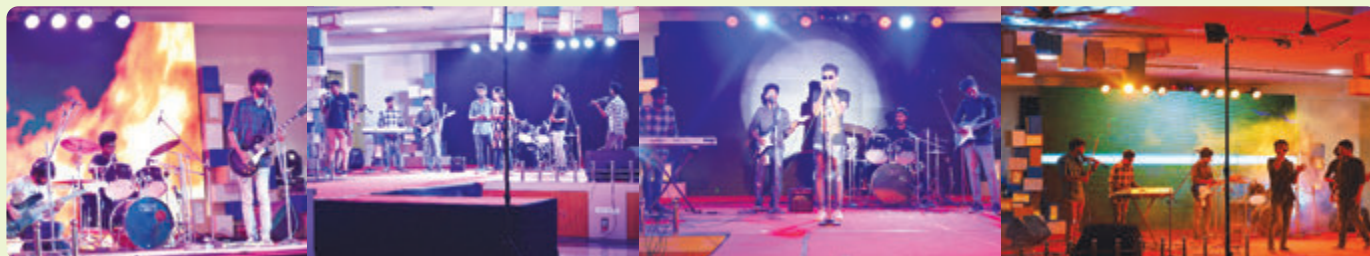
Tharang - Music Band Competition

Techfest events came to a mind blowing end with the music show of music band Masala Coffee