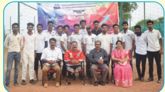
AHAS 2K18 Cricket Team