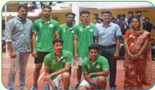
AHAS 2K18 Badminton Team