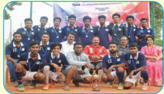
Football Team AHAS 2K18 Runners up