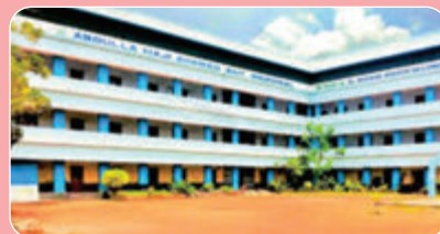
KMEA Al-Manar HSS