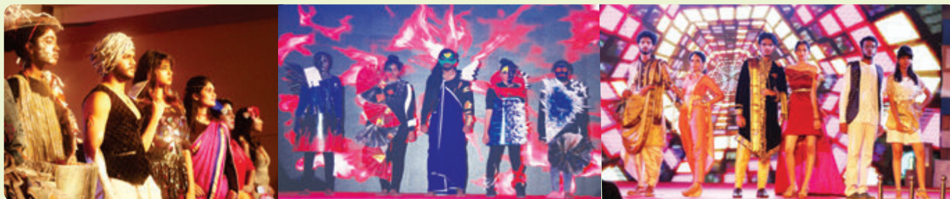
Praakrithi - Fashion Show