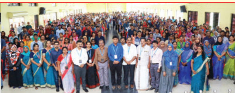
Ernakulam District collector Shri. K.Muhammed Y.Safirulla IAS with the PlusTwo students who secured A+ in all subjects were honoured by KMEA Engineering College during "Honouring the glittering stars".